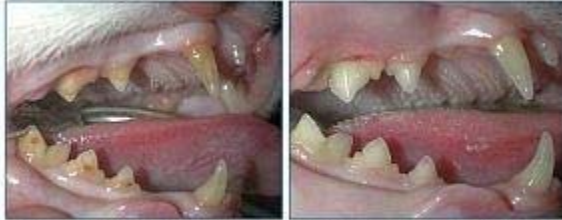
Cat's teeth - note tartar around teeth